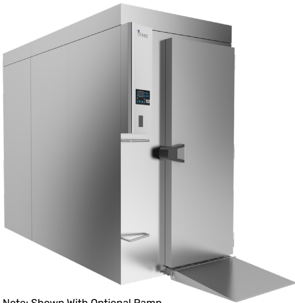
Note: Shown With Optional Ramp