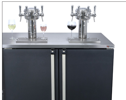
Shown: 2 Wine Fonts (MTM-4PSS-W), 2 Drip Trays (DP-1020). Order separately.