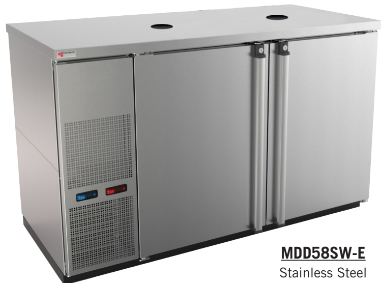
MDD58SW-E Stainless Steel