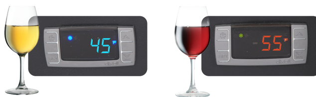
Dual Temperature: Built In Digital Thermostats