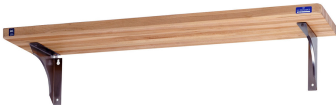
10" Wood Shelf F445-x-W