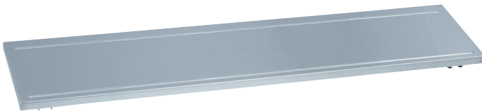
Tray Slide - Solid FSOLID-FX-x