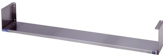
Dish Shelves F441-x-S