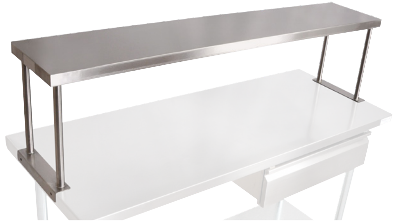
OS-ES-1248 (DOES NOT INCLUDE TABLE)