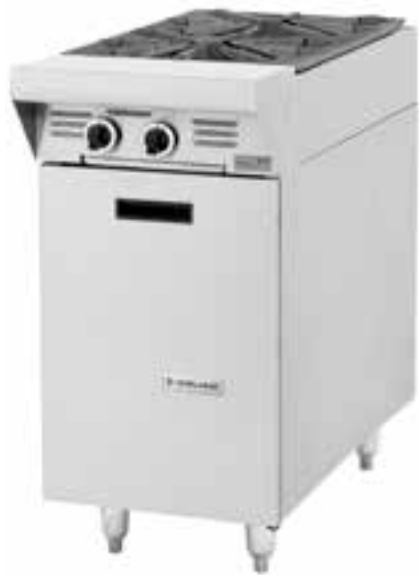
Model MST4S (valve control panel not as depicted) 17" Range Attachment With 2 Open Burners