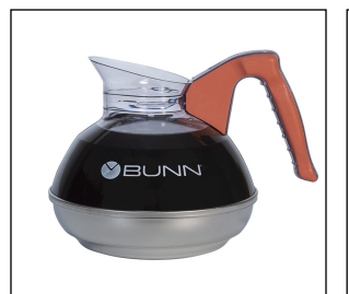
EASY POUR®,(ORN) 2/