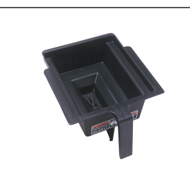
FUNNEL W/DECAL,PPK NAR BLK(LG)