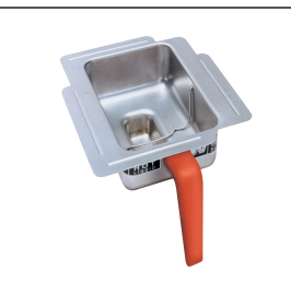
FUNNEL ASSY, SST-PP ORANGE HDL