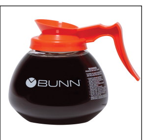
DECANTER,GLASS-ORN 12C 24/CS