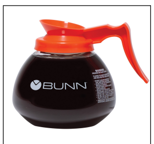
DECANTER, GLASS-ORN 12 CUP 1PK