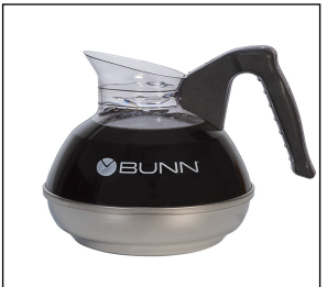
EASY POUR®,(BLK) 24/ CS