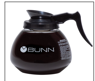
DECANTER,GLASS-BLK 12CUP 1PK