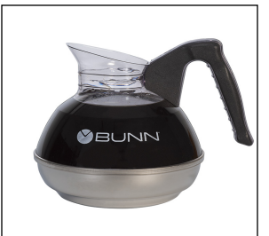
EASY POUR®,(BLK) 1/CS