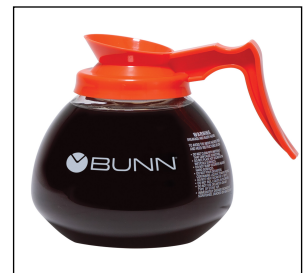
DECANTER,GLASS-ORN 12C 3/CS