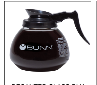
DECANTER,GLASS-BLK 12C 3/CS