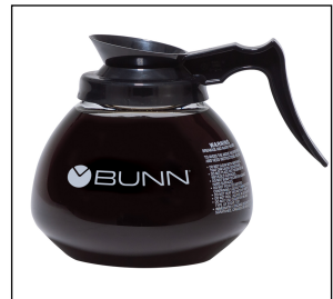
DECANTER,GLASS-BLK 12C 24/CS