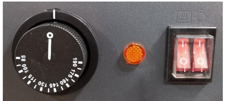
Manual Temperature Control