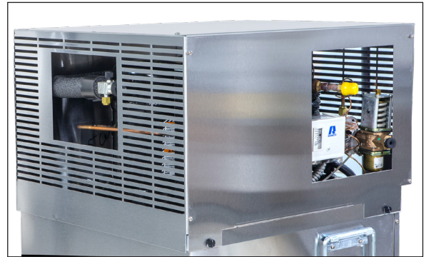
Reverse side showing water connections.