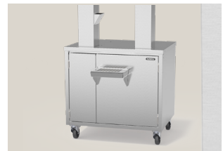
Service plus cabinet