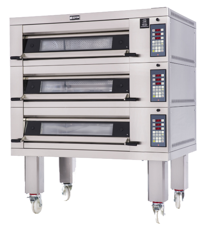
*SHOWN IN 2T3