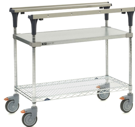
MS1836-FGBR: Solid Galvanized and Brite Wire Shelves