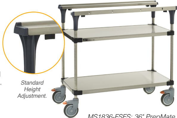
Standard Height Adjustment.