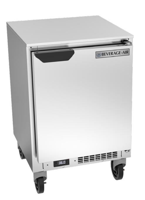
Note: Shown with optional full electronic control