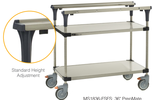
Standard Height Adjustment

** Testing completed by Pennsylvania State University Center for Food Innovation.