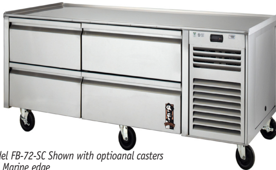
Model FB-72-SC Shown with optional casters and Marine edge