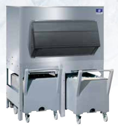
Ice Storage Bin and Cart System Includes two 240 lb. (109 kg) capacity carts with lids.

Featuring high-volume dispensing with patented "push-for-ice" rocking chute dispense mechanism and paddle wheel technology. Also available in an ice and water dispensing.