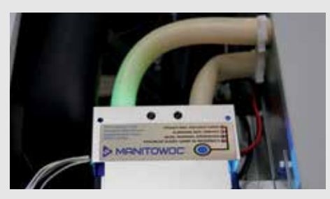
The LuminIce II space-saving design fits inside the ice machine so existing exterior clearances are not impacted. In addition, power for the unit is supplied through the ice machine's internal electrical supply so outlet space is conserved.

Available on both Indigo NXT and NEO series ice machines, the optional LuminIce II Growth Inhibitor creates "active air" by recirculating the air inside the ice machine foodzone components to inhibit the growth of yeast, bacteria, and other common micro-organisms.