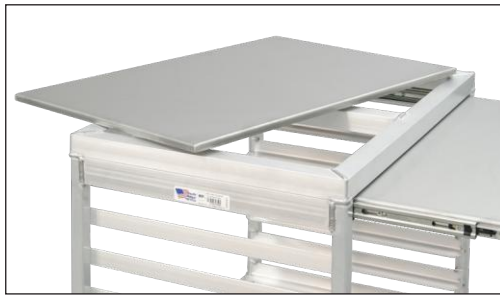
Retractable 16 GA Stainless Steel Pull-Out Shelf & Top Bracing

This versatile workstation saves counter space and can be moved throughout the kitchen or foodservice facility. Four 5" plate type swivel casters, all with total lock, eliminate all movement while slicing.