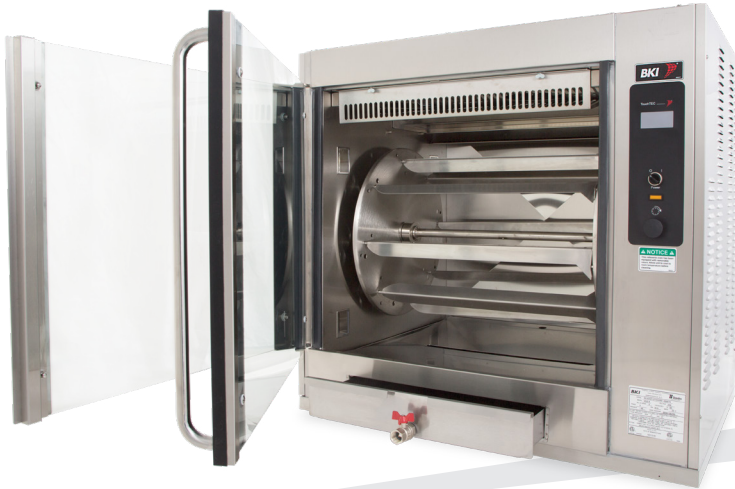
VGG-8-F model shown

Ideal for supermarkets and high-volume restaurants, the BKI® VGG-8-F-PT has an extra-large cooking capacity that will meet growing customer demand and improve profitability. The VGG-8-F-PT is a pass-through rotisserie, allowing the back of the kitchen to load raw product and the front kitchen to pull cooked product, thus reducing the risk of contamination.