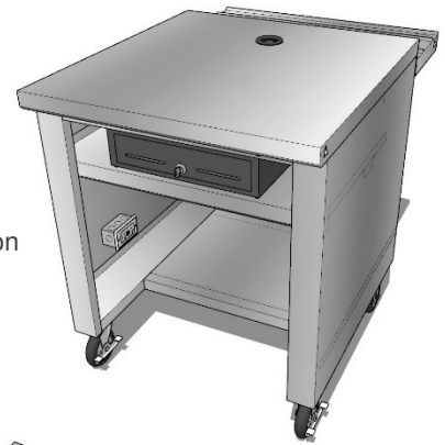
*Single cashier station