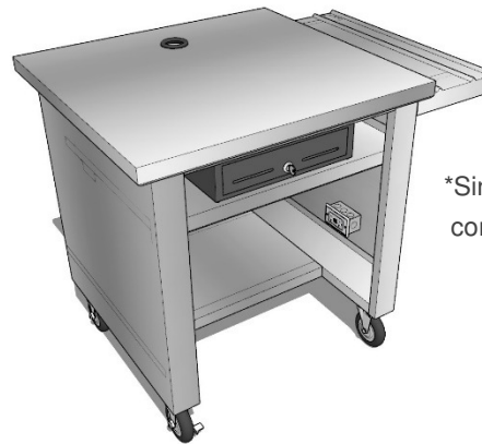
*Single cashier side configuration RIGHT