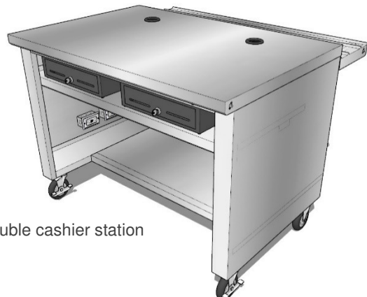
*Double cashier station