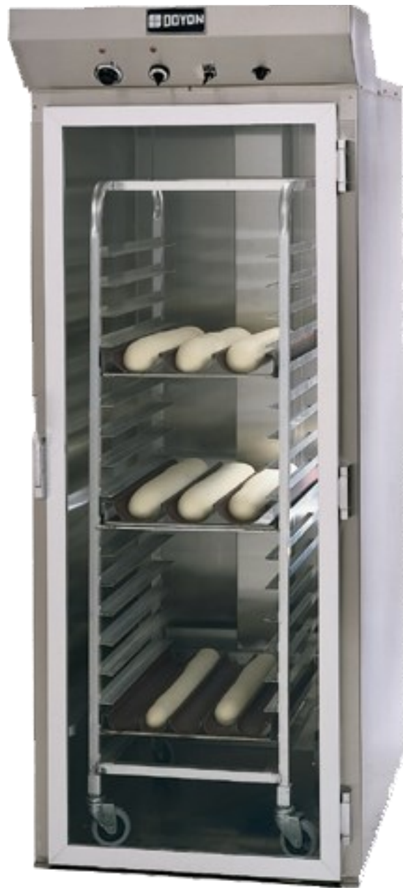
Proofer Cabinet, Roll-In, One-Cavity, (1) TLO Double or (2) Single Rack Capacity, Solid State Heat & Humidity Controls, Auto Water Entry, Full View Glass Door, Stainless Steel Interior and Exterior, Aluminum Floor, NSF, cETLus, ETL