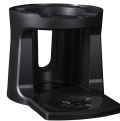
STAND ASSY KIT, TF SERVER