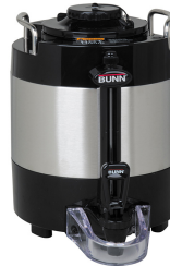
TF SERVER, 1G/3.8L MECH NOBASE