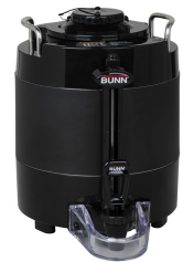
TF SERVER, 1G/3.8L MECH BLK NOBASE