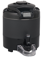
TF SERVER, DSG2 1G BLK NOBASE