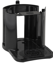
STAND ASSY, TF SERVER