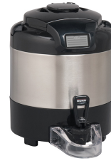
TF SERVER, DSG2 1G SST NOBASE