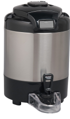
TF SERVER, DSG2 1.5G SST NOBAS