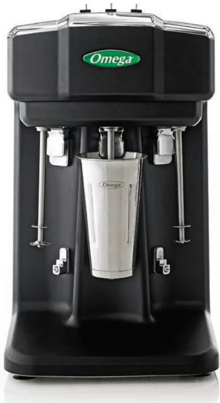
Model M3000 Triple Spindle Milkshake Machine