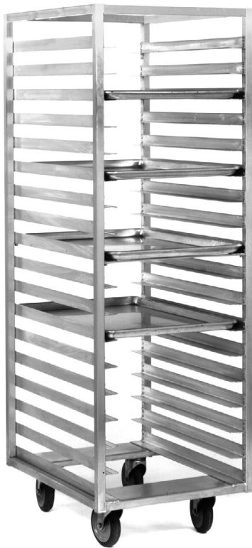
roll-in refrigerator rack

Eagle Panco® Roll-In Refrigerator Rack, aluminum model _____ . Frame, corner uprights, top and bottom constructed of 1" square aluminum tubing. 1 1/8" x 1 1/8" extruded aluminum tray slides with raised beads to minimize friction. Slide spacing to be 2 1/4", 3", or 5" to accommodate (24, 18, 11, or 36) trays. Furnished with 5"-diameter casters. Shipped assembled. Note: Model #UARR-64-A comes with 12 universal angle slides, accommodating a variety of pan/rack sizes.