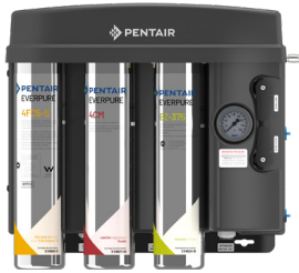
EZ-RO 375/5G-BL wall mount