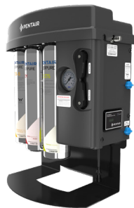
EZ-RO 375/5G-BL with optional floor stand bracket