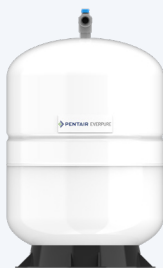
5-gallon hydropneumatic tank