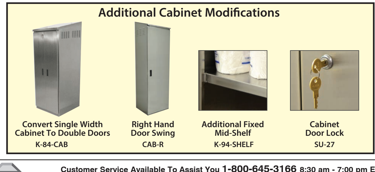
Standard Left-Hand Swing Door Shown *Optional Right-Hand Door Swing Available - See Below