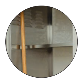
Top 12" Fixed Shelf Allows Room For Mops and Broom Handles