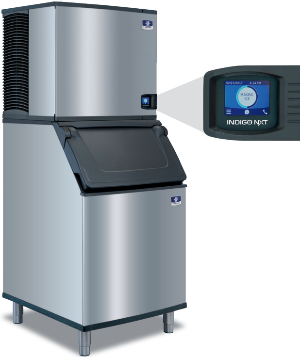
Indigo NXT Series IT0900N Ice Machine on a D570 Bin *Ice machine and bin sold separately

Designed for operators who know that ice is critical to their business, the Manitowoc Indigo NXT Series Ice Machine provides reliable and consistent performance. Built-in preventative diagnostics and programmable operation help minimize downtime and optimize total cost of ownership.