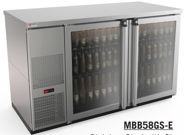
MBB58GS-E Stainless Steel with Glass Doors