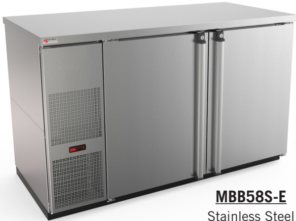
MBB58S-E Stainless Steel