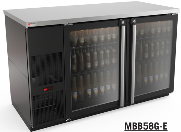
MBB58G-E Black with Glass Doors