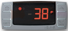
Adjustable Digital Thermostat! Easy to read exterior mounted