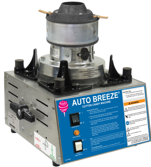
Unit view without Floss Pan