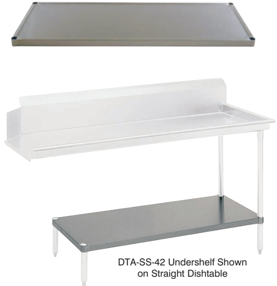
DTA-SS-42 Undershell Shown on Straight Dishtable