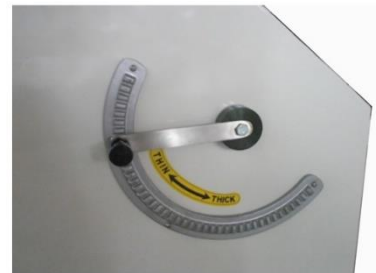
Side View of Handle Control for Dough Thickness

*Also available with red sides. Stock may vary when ordered. Please confirm with your dealer at time of purchase.