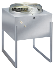
Standard Air-Cooled Remote JCT1200-261

Ice storage bin and JCT1200-261 remote condenser must be ordered separately. Consult remote condenser specification sheet for details. Tubing Kits come pre-charged with quick connects.