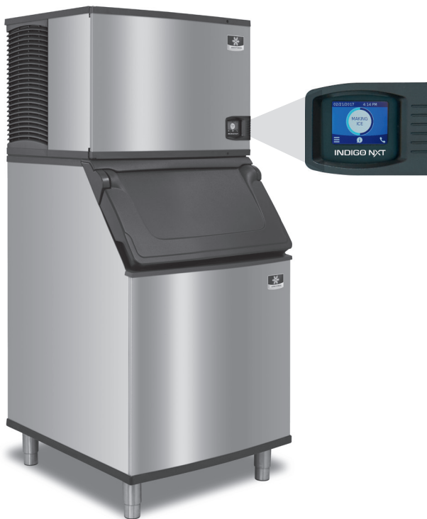
Indigo NXT Series IT0750N Ice Machine on a D570 Bin *Ice machine and bin sold separately

Designed for operators who know that ice is critical to their business, the Manitowoc Indigo NXT Series Ice Machine provides reliable and consistent performance. Built-in preventative diagnostics and programmable operation help minimize downtime and optimize total cost of ownership.