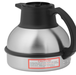
THERMAL CARAFE, ORN 1.9L 12PK