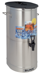
TDO-5, RESERVOIR, BREW THRU