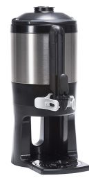
TF SERVER, 1.5G MECH GEN3