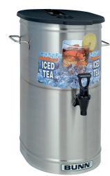
TDO-4, RESERVOIR BREW THRU