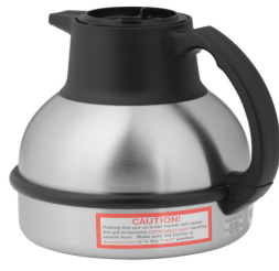
THERMAL CARAFE, BLK 1.9L 12PK