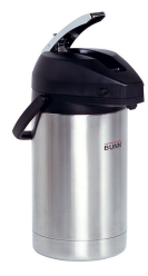
AIRPOT, 3.0L SST LA 6/ CASE