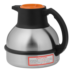
THERMAL CARAFE, ORN 1.9L 1PK