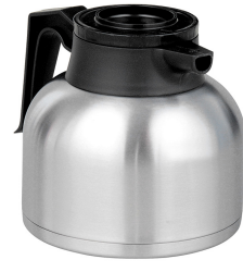
CARAFE,SST 1.9L SHRT BLK 1