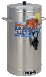
TDS-3, 3 GAL