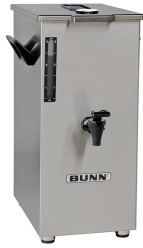
TD4T, BREW THRU LID NO DECAL NUDGER HDL