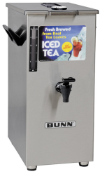
TD4T, BREW THRU LID NUDGER HDL