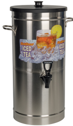
TDS-3.5, 3.5 GAL