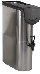
TDO-N-3.5, W/BREW THRU LID