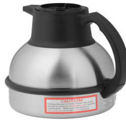
THERMAL CARAFE, BLK 1.83 L 1PK