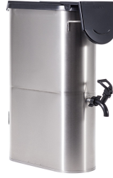
TDO-N-3.5,RSVR W/ PINCHTUBE/BREW THRU LID