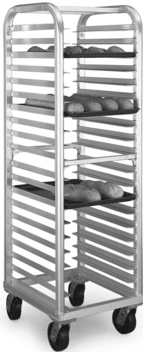
LIFETIME Series bun pan rack

Eagle LIFETIME Series Bun Pan Rack, model _____. Constructed of heavy duty 6063-T5 aluminum alloy. Fully welded frame. 1" square tubular crossbracing. Base consists of 1½" x 1½" square aluminum tubing with pretapped caster plates welded inside. 3¼" wide angle slides welded to uprights. Heavy duty 6" x 2" non-marking swivel plate casters.