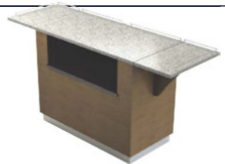
#79868 V in puritan pine veneer with rocky road granite