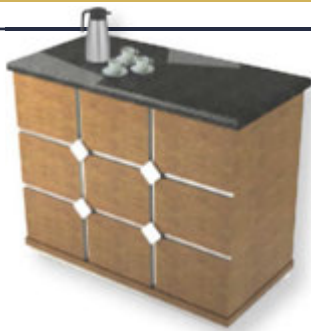
Bristol Collection #79989 V in puritan pine veneer with ebony granite top