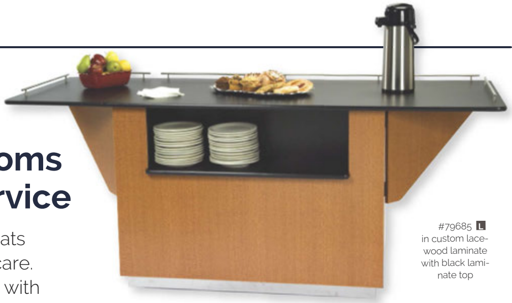
#79685 L in custom lace-wood laminate with black laminate top

Keep them in their seats and show them you care. Food setup is a cinch with a cart that holds its own in the boardroom or even a stadium suite.