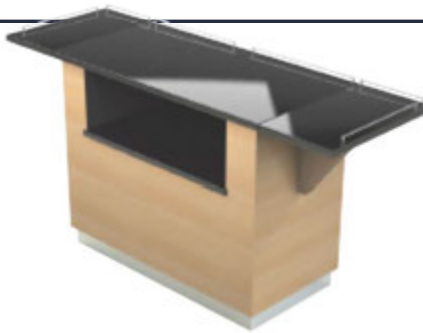
#79685 L in amber maple laminate with black laminate top