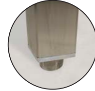
Stainless Steel Adjustable Bullet Feet