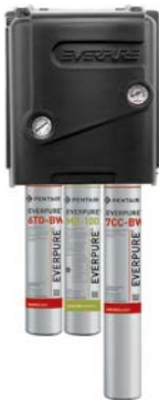
MRS-100CC-BL System: EV9973-63 (115 VAC/60 Hz)

CONFIGURABLE SYSTEM THAT DELIVERS REVERSE OSMOSIS OR BLENDED WATER FOR MULTIPLE FOODSERVICE APPLICATIONS