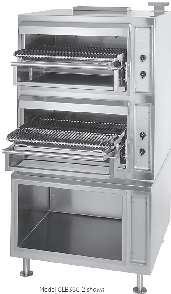
Model CLB36C-2 shown