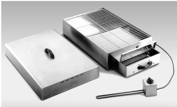
FM-2 - CORONA 120 V

Use natural sawdust, preferably beech wood, to smoke your fish (salmon, trout, eel, herring, etc.), shellfish (lobster, crawfish, mussels, etc.), meat (duck breasts, filet mignon, etc.), delicatessen (sausage, bacon, ham, etc.), vegetables and cheese at a very cost-effective price!