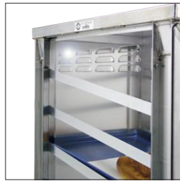
Vented Lexan Side Panels