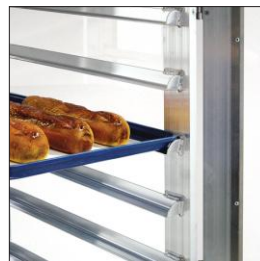
Angle Guides With Stops

This unit provides an attractive display with high product visibility. It combines an "open" look with the protection of an enclosed cabinet.