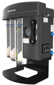
EZ-RO 375/16G-BL with optional floor stand bracket