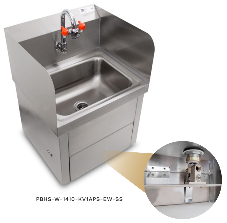
KNEE ACTIVATED FAUCET WITH HINGED FRONT APRON