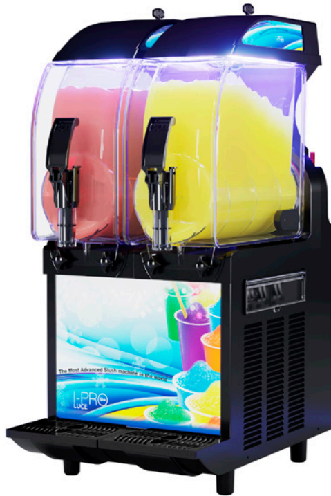
Model I-PRO 2M UV with light panel