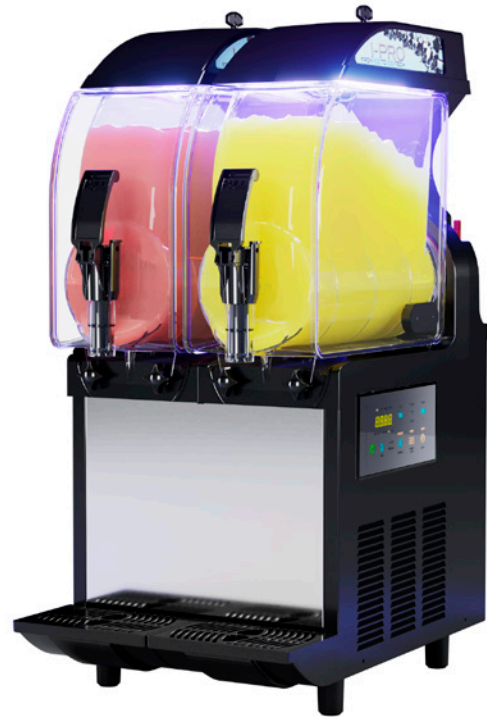
Model I-PRO 2E UV