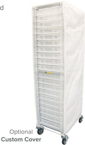
Optional Custom Cover