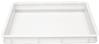
Optional Solid Pasta Tray