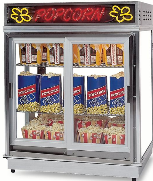
General reference image shown.