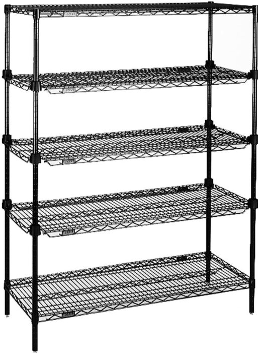
shelves and posts combined to form a unit

Eagle Add-A-Shelf® (EAGLEbrite®, chrome, black, red, white) (Adjustable, Reverse Mat) Wire Shelving, model _____. Patented QuadTruss® design for increased strength. Special collar allows for addition or removal of a shelf to an entire unit. Top and bottom shelves must be standard design and fixed in place. 1"-diameter numerically grooved posts.