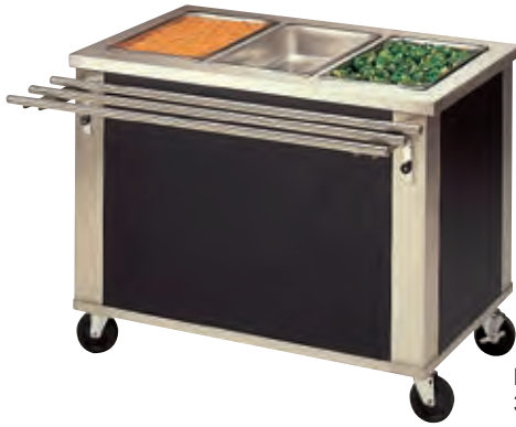
DXP3HF shown with optional 3-bar tray slide and formica finish