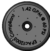
Black 1.42 GPM Spray Face