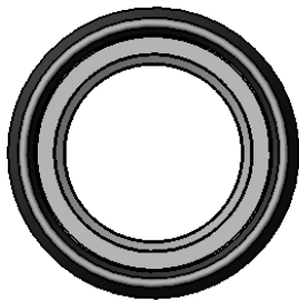
Black Tapered Rubber Bumper