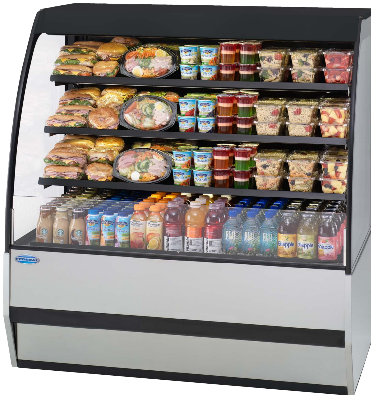
Model SSRPF5952 Shown

Designed for those customers looking for up-market styling for maximum visual appeal that will drive product sales.