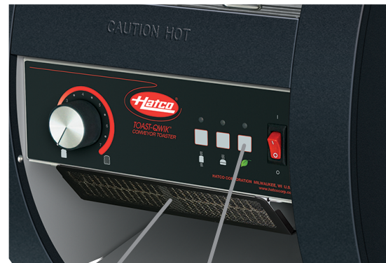
Air Intake Filter Screen