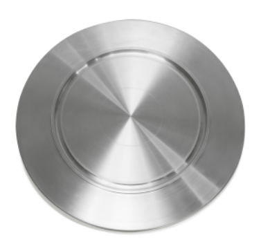
12-inch Mold MID12