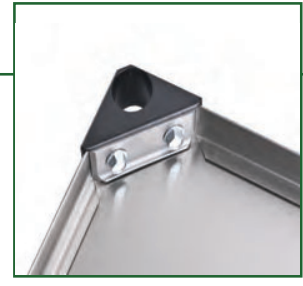
Die-cast corners with heavy-duty bolt construction.

Stainless steel posts available in 63", 74" and 86" lengths in both stationary and mobile options (see page 7).